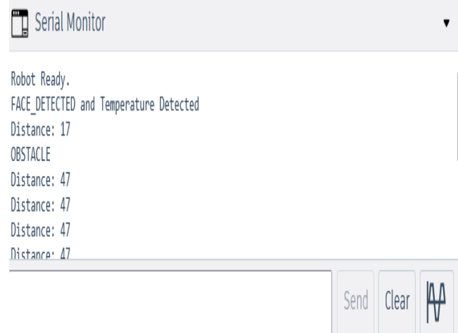
Figure 2. Performance analysis of proposed model

continuously monitoring its surroundings to avoid obstacles. When the robot detects the obstacle in a distance it stops to avoid collision. It performs obstacle avoidance function life turning left, right moving forward, backward without any human intervention. The system uses light and sound to inform user about the events like face recognized, input is taken, temperature is detected. Additionally, the system is expected to demonstrate smooth integration between sensing, control, and alert mechanisms. The overall response time from detection to feedback is expected to be low, ensuring real-time operation suitable for hospital environments. This model expected outcome includes improved screening efficiency, reduced human involvement, and safer patient-robot interaction.